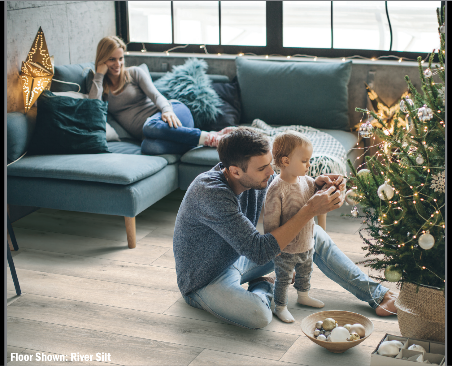
Floor Shown: River Silt